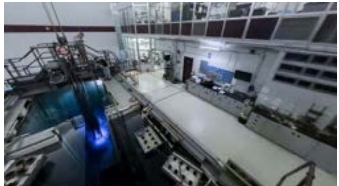
The McMaster Nuclear Reactor is the source of neutrons for a neutron beam lab under development there.

In addition, McMaster University led the community to develop a strong case, supported by 17 universities, to the Canada Foundation for Innovation 2020 Innovation Fund for a major investment to establish two foreign partnerships and to build the neutron beamlines that are prerequisite for the full exploitation of the McMaster Nuclear Reactor. Operated as a national user facility, the McMaster Nuclear Reactor could provide access to certain high-demand ‘workhorse’ techniques for which broadband, continuous neutron intensities are appropriate. (Experiments requiring pulsed or cold neutrons or a high neutron brightness, especially neutron spectroscopy, would be conducted elsewhere.) Over $10M has already been invested, including $2M from the university itself, in the development of the neutron beam lab at the McMaster Nuclear Reactor. Progress